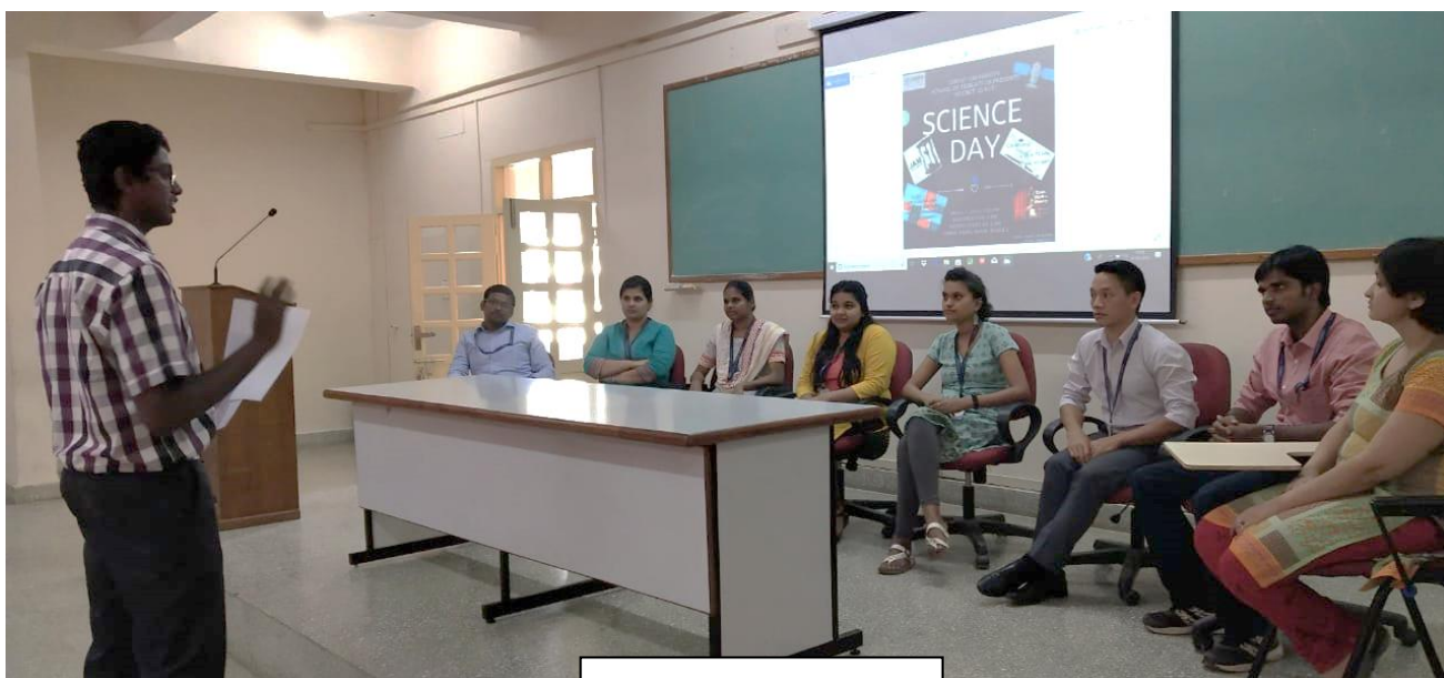
Just a Minute